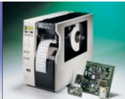
96 XiIIIPlus ™

With a print resolution of 600dpi—the 96 XiIIIPlus —is unmatched at printing precise bar codes, text and graphics information in limited label space. This printer is ideal for applications that require extremely high resolution—labeling electronic components, telecommunication assemblies, computer peripherals, small pharmaceutical packaging, diagnostic research samples, and more.