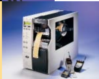
90 XiIIIPlus ™

The 90 XiIIIPlus printer is ideal for applications that require small, high-resolution bar code labels, such as tracking printed circuit boards and small parts, and identifying small products. The printer's standard 300dpi printhead ensures text, graphics and bar codes always print clearly—essential when label space is limited.